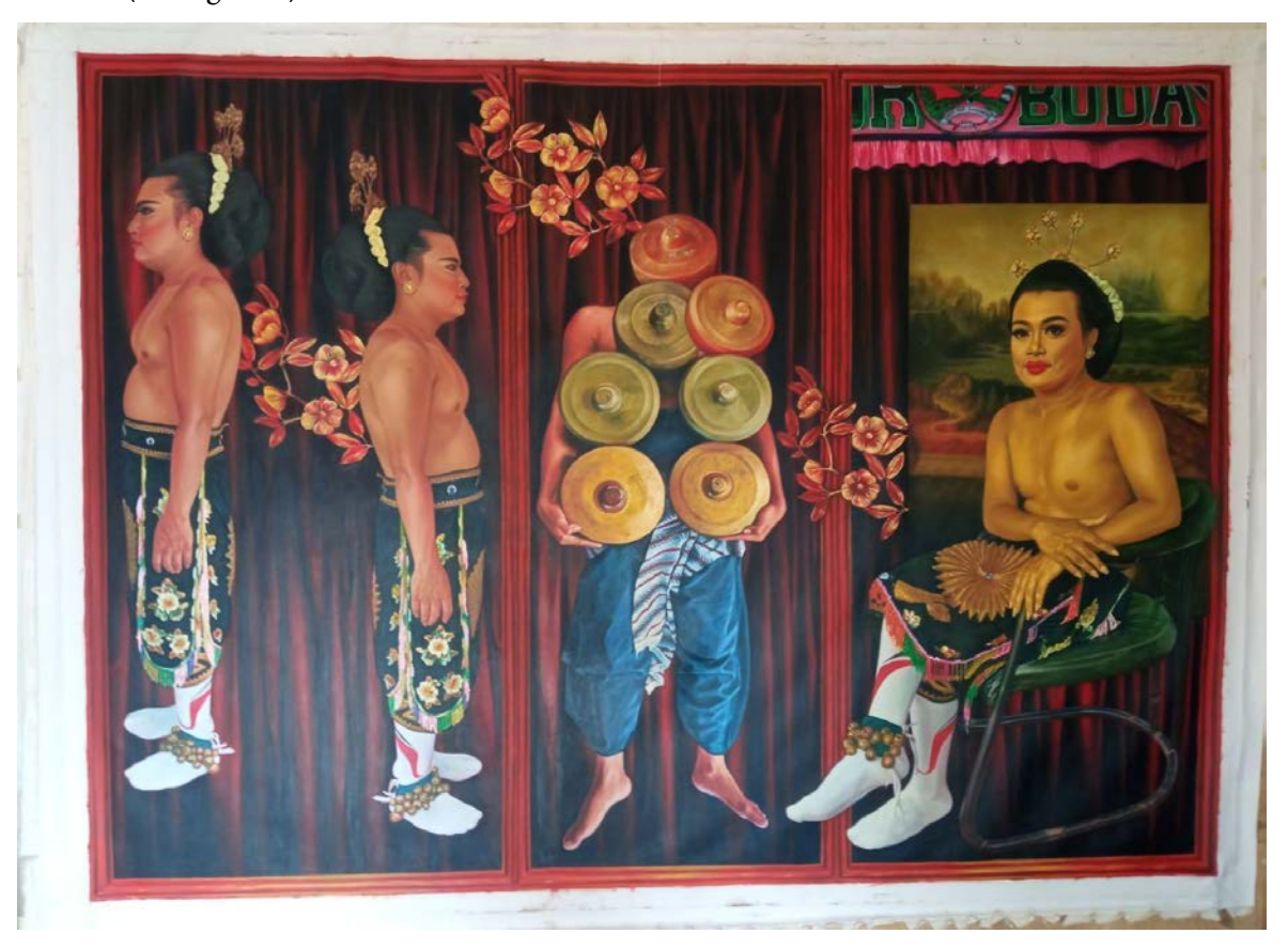
Figure 2: "Primadona Ludruk", 2022 (in progress), Moelyono, oil paint on canvas, 120x200 cm.

Pak Totok suggested that I travel to Jombang for a more affordable option. I also connected with groups in southern Malang. During this process I ended up meeting two transgender performers, and, after having conversations with them, I took their photos and painted Primadona Ludruk (see Figure 2).