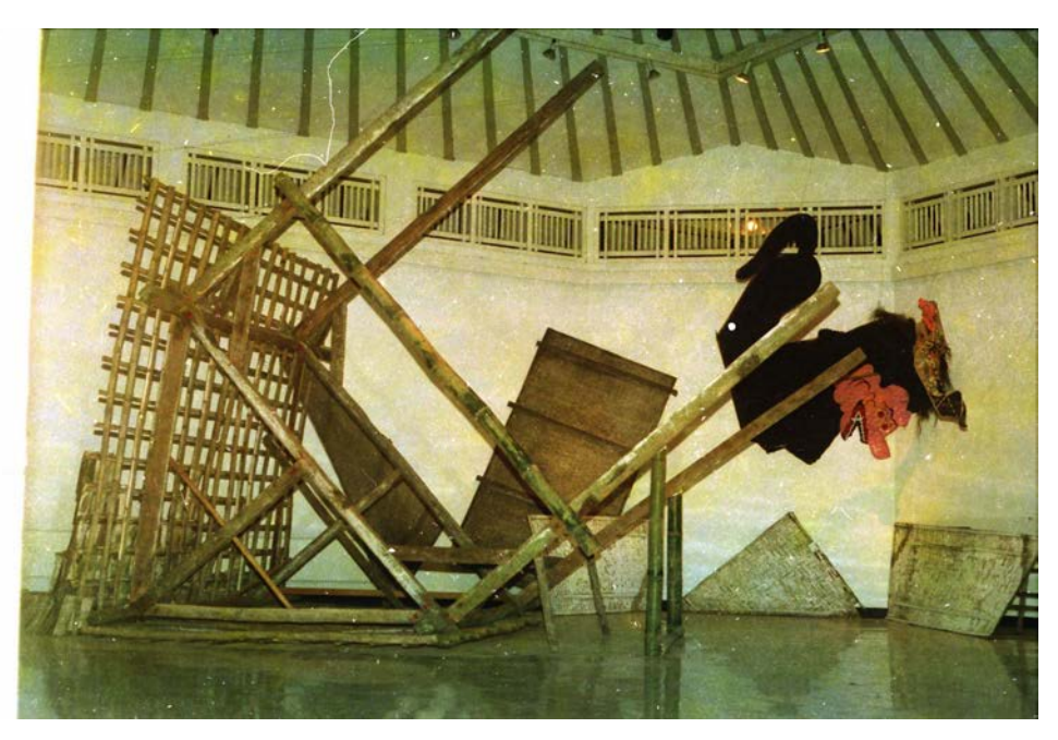
Figure 1: Jaranan Butho hanging on the wall at the Reflections of the Environment exhibition in Central Java in 1994. Photograph courtesy of Hyphen—& Moelyono.

His radical, site-specific and community-engaged exhibition practice is of great historical importance to the Indonesian art scene. In 1994, his exhibition titled Reflections of the Environment was staged to draw attention to the rapid development of Wonorejo in central Java. With the help of his activist friends, they collectively built an installation of a water tunnel made of wooden planks, based on the construction of a controversial dam in Wonorejo. The installation was built with the ruins from resident's houses who had since been displaced, and traditional art objects provided by the local community (see Figure 1). At the exhibition, Moelyono invited the audience to reflect on the consequences of forced displacement in the name of development. The exhibition encouraged the local community to develop empathy for people who are displaced in development processes and drew attention to the consequences of inadequate compensation, the loss of community due to displacement, and the connection to land and culture through place.<sup>1</sup>