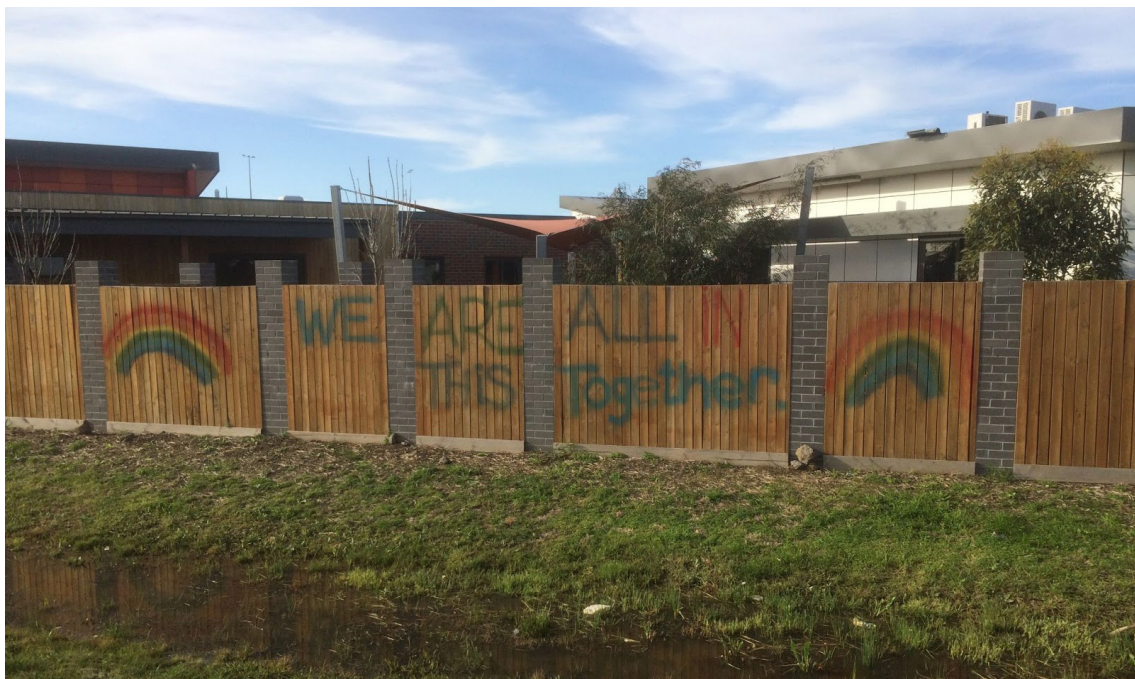
Image 3: Painted mural at kindergarten in Diggers Rest adjacent to main road.

I felt that people were taking more liberty with public space for emotional reasons. A resident of Gladstone Park who had never previously considered herself to be an artist began regularly drawing on her front footpath in chalk. Decorated spoons were being plugged into the ground to form mini villages of spoonvilles all over Australia. People who previously may not have contributed to art in public space, began to participate in this field. A kindergarten in Diggers Rest made a hasty mural on its fence that faced a busy road. Normally artworks in public space required permits but it seemed that artworks were popping up as responses to the situation without the usual permission process.