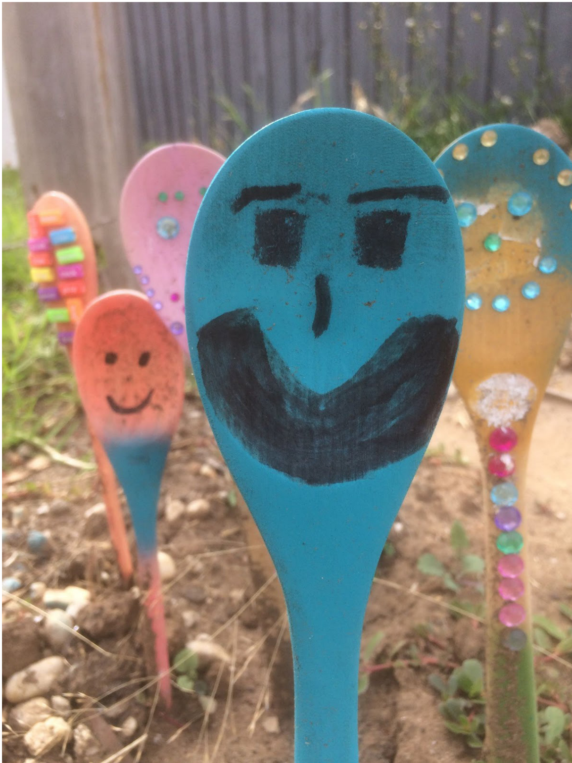
Title Image: Spoonville, Kings Road, Delahey.