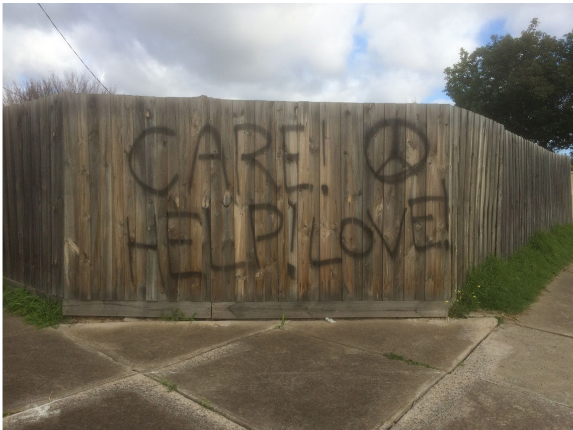
Image 1: Fence in my suburb: CARE, PEACE, HELP, LOVE.

I noticed more use of fences for slogans of positive messages. In my suburb I noticed two fences of empty houses that were used by a writer. One fence said 'Love', and another said 'Care, peace (symbol), help and love'. Neither were removed by cleaners with the usual speed. Later the one that said 'Love' was changed to say 'Love Melbourne'.