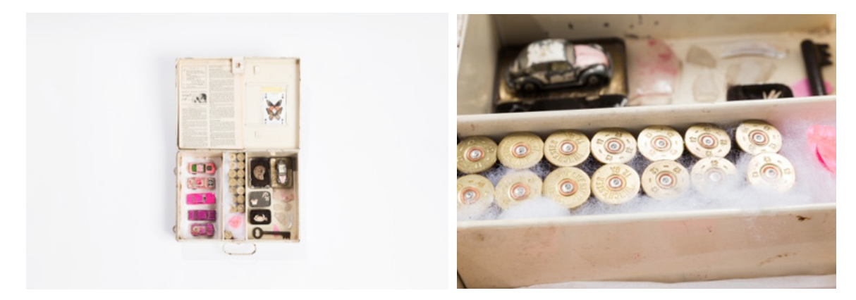
Fig (1) Amber Smith: When your child won't eat: how to give your mother sleepless nights (2018). Fig (2) detail<sup>16</sup>

We are continually making decisions and assessments in order to craft our reality and it is this process that equates walking with an embodied collecting practice. What also equates the walker to the collector is a sense of a gentle and time-consuming productivity. For the collector it's the sense that they are productive even if are only accumulating, rather than making – they are making a collection. Walking is also a productive form of idling and there is a sense of achievement despite there being no concrete reward. Physical space, metaphysical space and the conditions required for self-examination and locating ourself within the world in a philosophical sense, require a degree of internal and external mind-mapping. That is, the sense that there is a correlation between 'what is before our eyes and the thoughts we are able to have in our heads: large thoughts at times requiring large views, and new thoughts, new places' (Botton, 2002). Through collecting and walking and collecting, we are constantly recording and representing the constellations of our experience – creating material traces of impermanent perceptions.