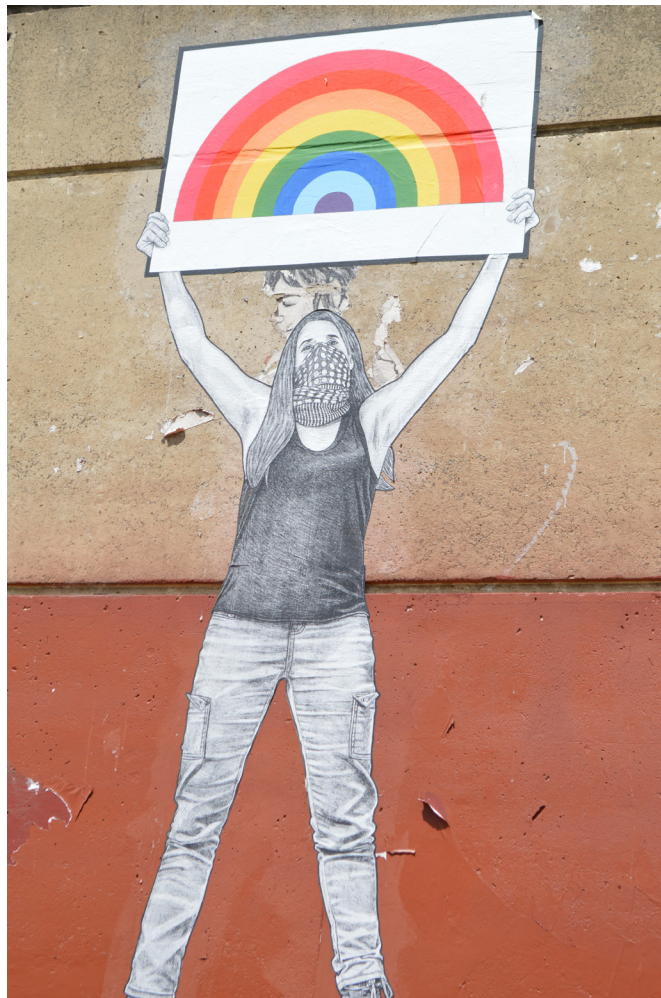
Figure 1: Public Mural

Welcome to the second edition of the Journal of Public Pedagogies . At the time of writing this editorial in Melbourne, Australia we are immersed in a public debate on same sex marriage as the Government conducts a postal vote on this 'issue'. It has been hard to escape the publicness of opinion and the association of the 'right' to marry as argued as a threat to heterosexuality and the demise of the nuclear family. Specifically, the idea that being Gay will be become so 'normalised' it will be encouragingly taught about in schools. The argument stops just short of the statement 'they are going to teach you to be gay'. I would argue for strong resistance to public rhetoric designed to further 'other' marginalised people such as the LGBTQI community. What this debate has crystalized, among other things, is the necessity and problematics of knowledge constructions outside and inside of formal institutions. As people engaged in the theories and practices of public pedagogies we are called on to think about where knowledges reside and who is determining of what knowledges are valued. Constructions of knowledges are never neutral despite how benign they may appear.